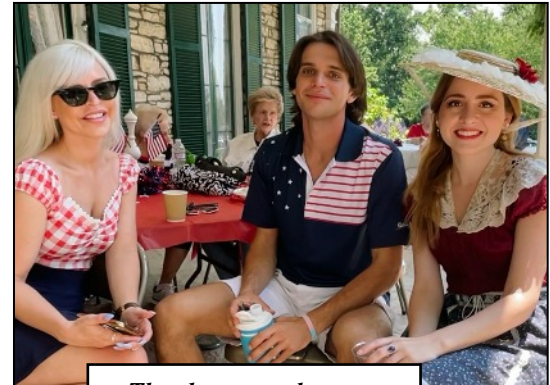
Thanks so much to our wonderful volunteers! Another successful 4<sup>th</sup> of July Breakfast has gone off with a BANG and we couldn't have done it without <u>all</u> of you!