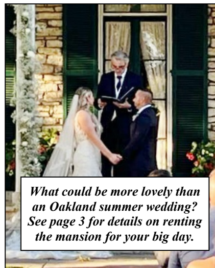
What could be more lovely than an Oakland summer wedding? See page 3 for details on renting the mansion for your big day.